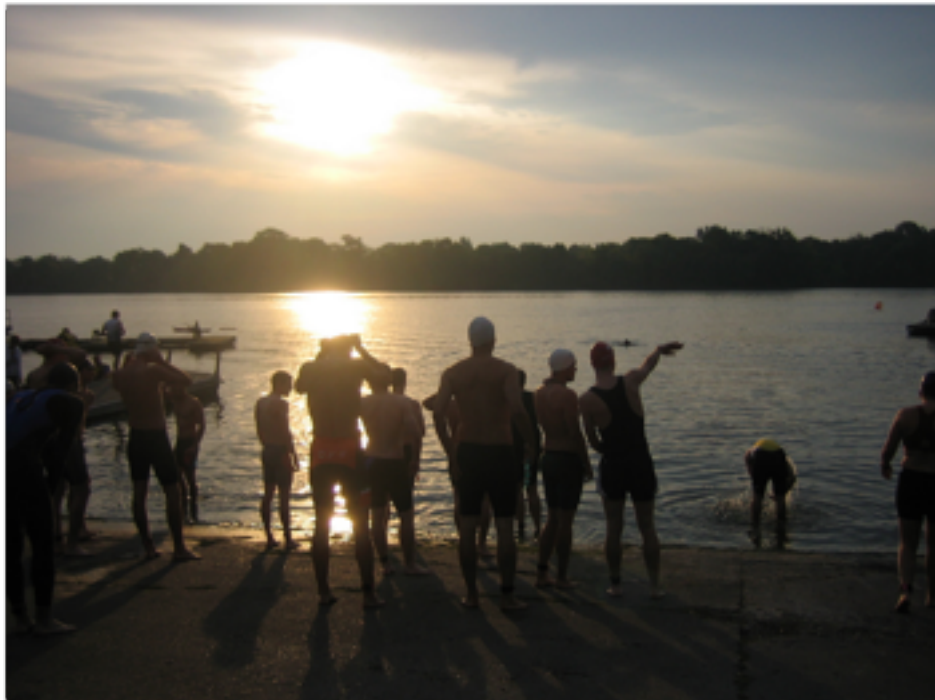
Swimmers survey the triathlon course at Middlefork Reservoir