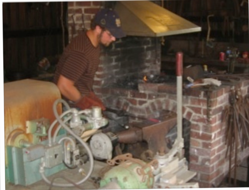
Forge at the Wayne County Historical Museum

This is a plan for Richmond. It's a specific plan for how I will approach some of the issues facing our community today and in the future, if I'm elected to City Council. Some of the proposals here are not new, some of them are already in progress, and some will change over time. But all of these plans are important, and will require collaboration, creativity and patience to see realized.